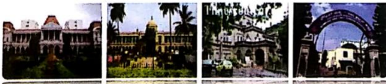
Professor & H.O.D. Dept. of Transfusion Medicine Victoria Hospital, BMCRI