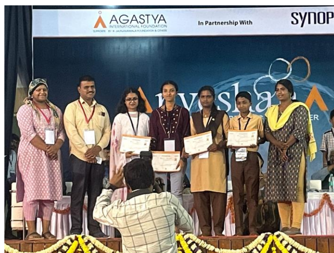
POTENTIALS OF TURMERIC LEAF EXTRACT CHATURHY and TRISHA (Consolation Prize)