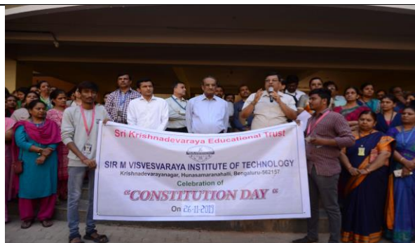
Constitution day Celebration 26-11-2019