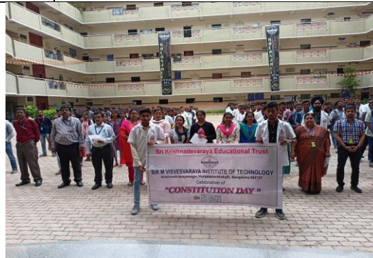
Constitution day Celebration 25-11-2023