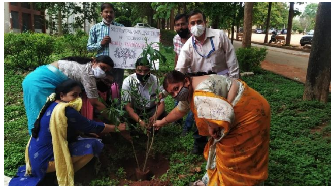
World Environment Day celebration –05-06-2020