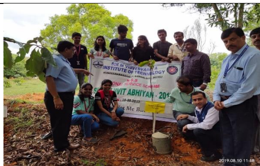
Sapling Planting On 10-08-2019