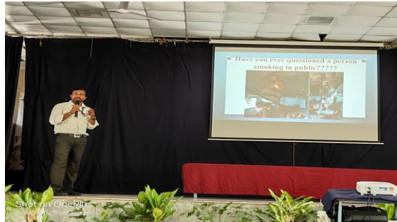
NSS Orientation Program on 12-09-2023