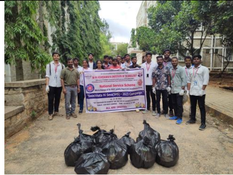
NSS, YRC and Nisarga of Sir MVIT Organized cleanliness drive " Swachhata Hi Seva (SHS) - 2023 Campaign - Shramadaan " on 01-10-2023 .