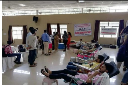
Blood Donation Camp was organized by NSS and YRC of Sir MVIT in Association with Lions Club JP Nagar Ethics, collected 357 units.