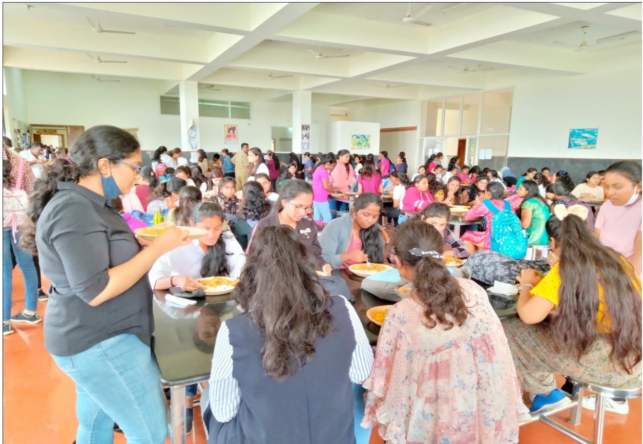
Lunch time at VTU PG Center, Muddenahalli.