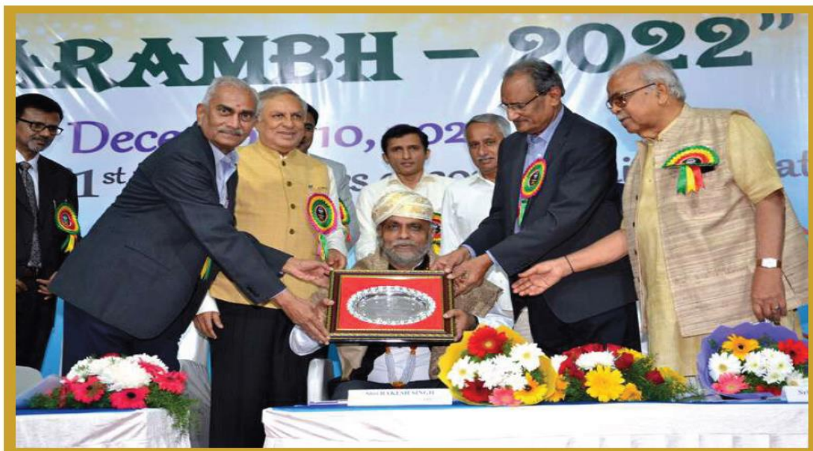
Felicitation to the Chief guest by the Office Bearers and Trustees of SKET & Principal