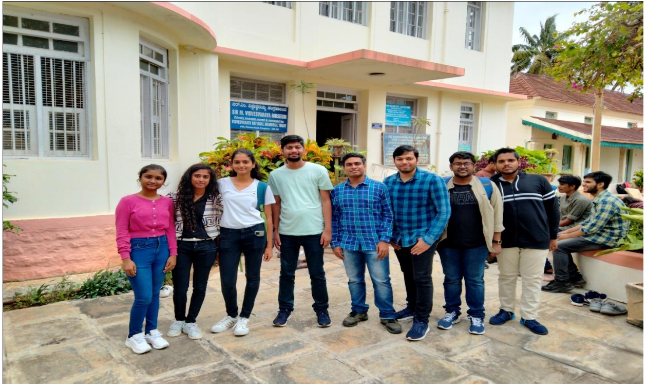
Students at Sir MV's Museum, Muddenahalli.