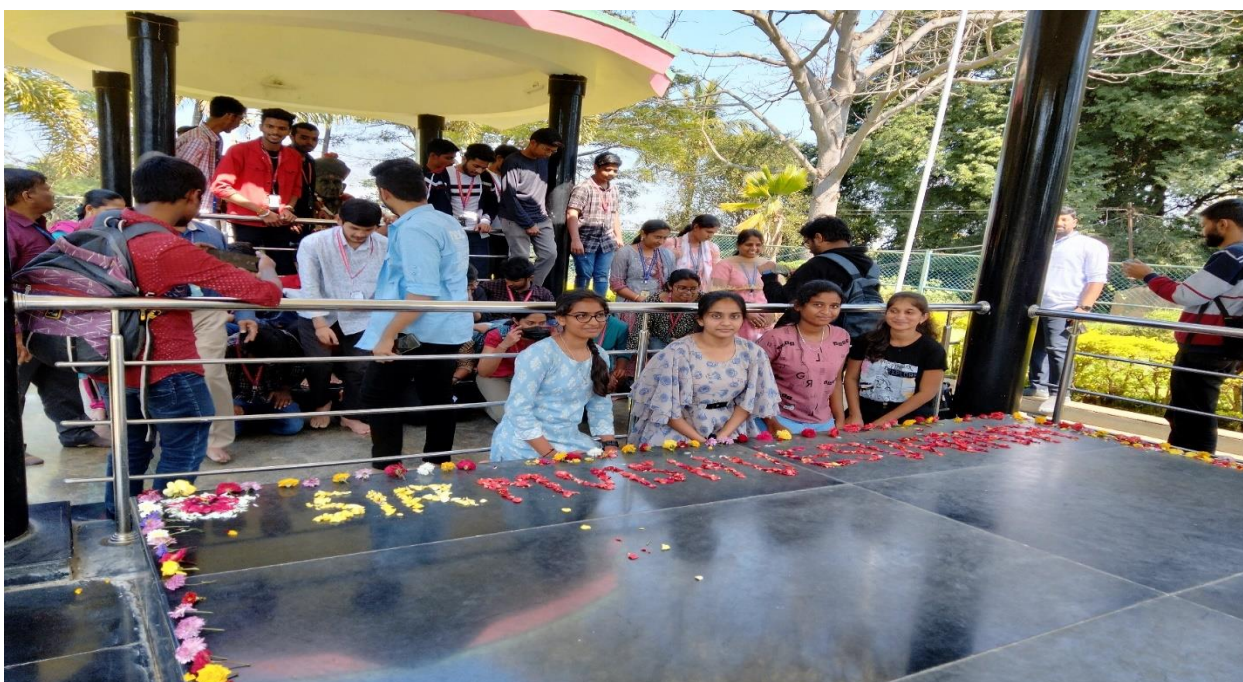
Floral decoration by the students at Sir MV's Samadhi, Muddenahalli