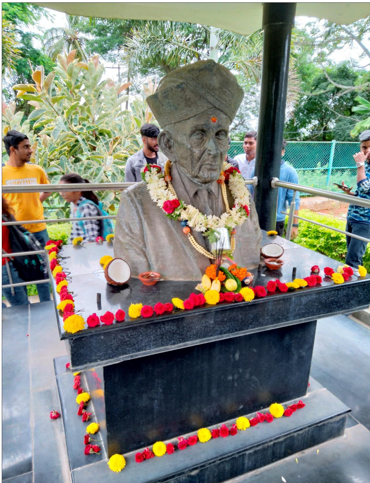
Sir MV's memorial at Muddenahalli