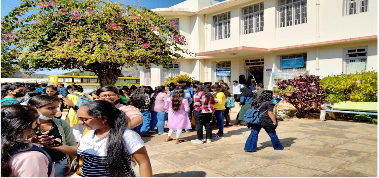
Students visit to Sir MV's Museum at Muddenahalli