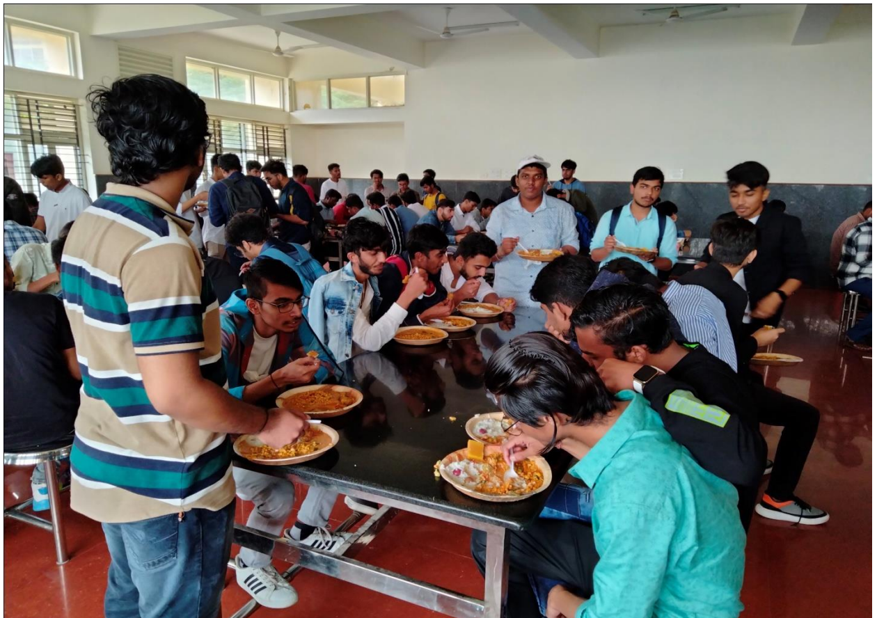
Students having lunch at VTU PG Center, Muddenahalli.