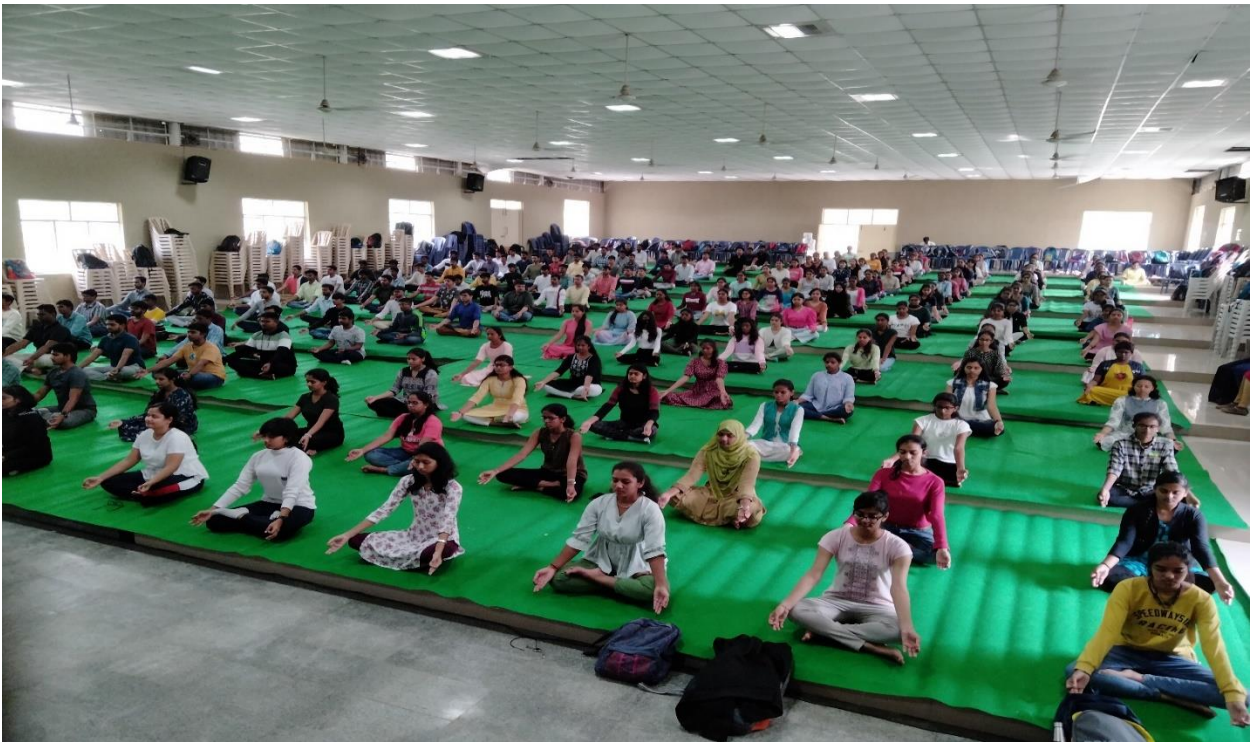
Student performing Yoga sessions