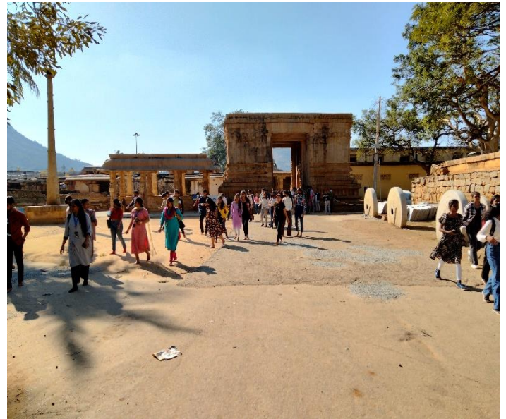
Students visit to the Nandi temple at Nandigrama near Muddenahalli.