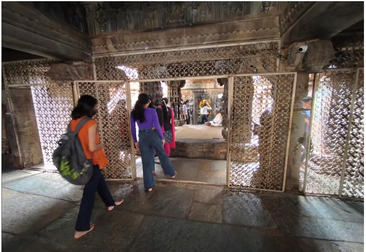
Visit to Bhoganandiswara Temple at Nandi-Grama, Chikkaballapur.