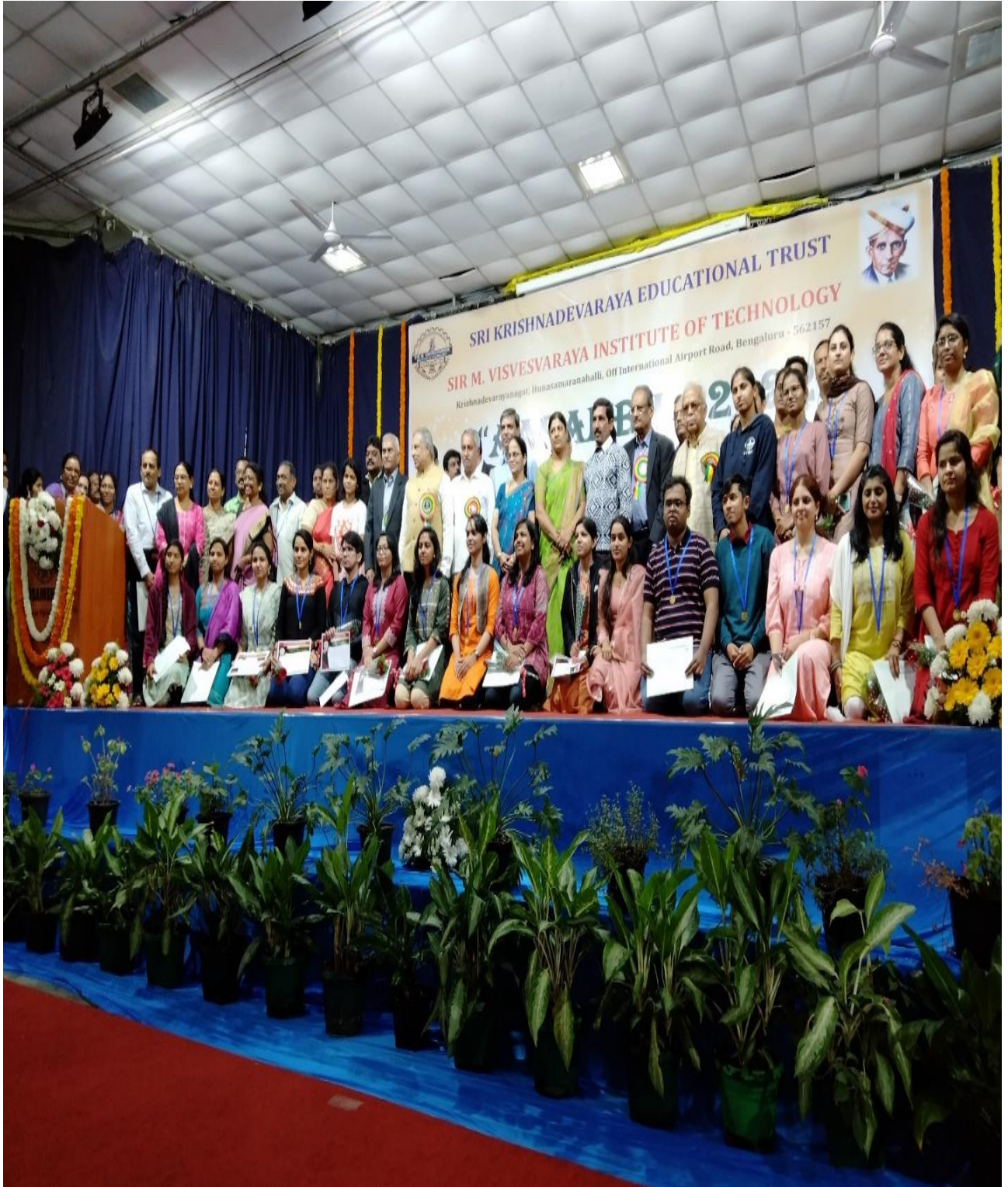
Felicitatation of VTU Rank holders