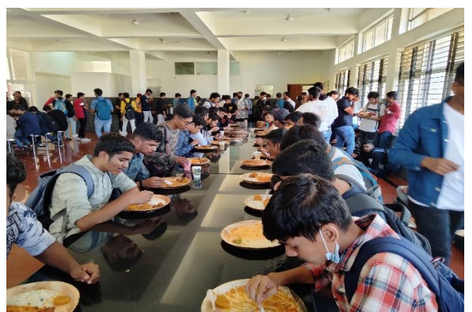
Students and faculties having lunch