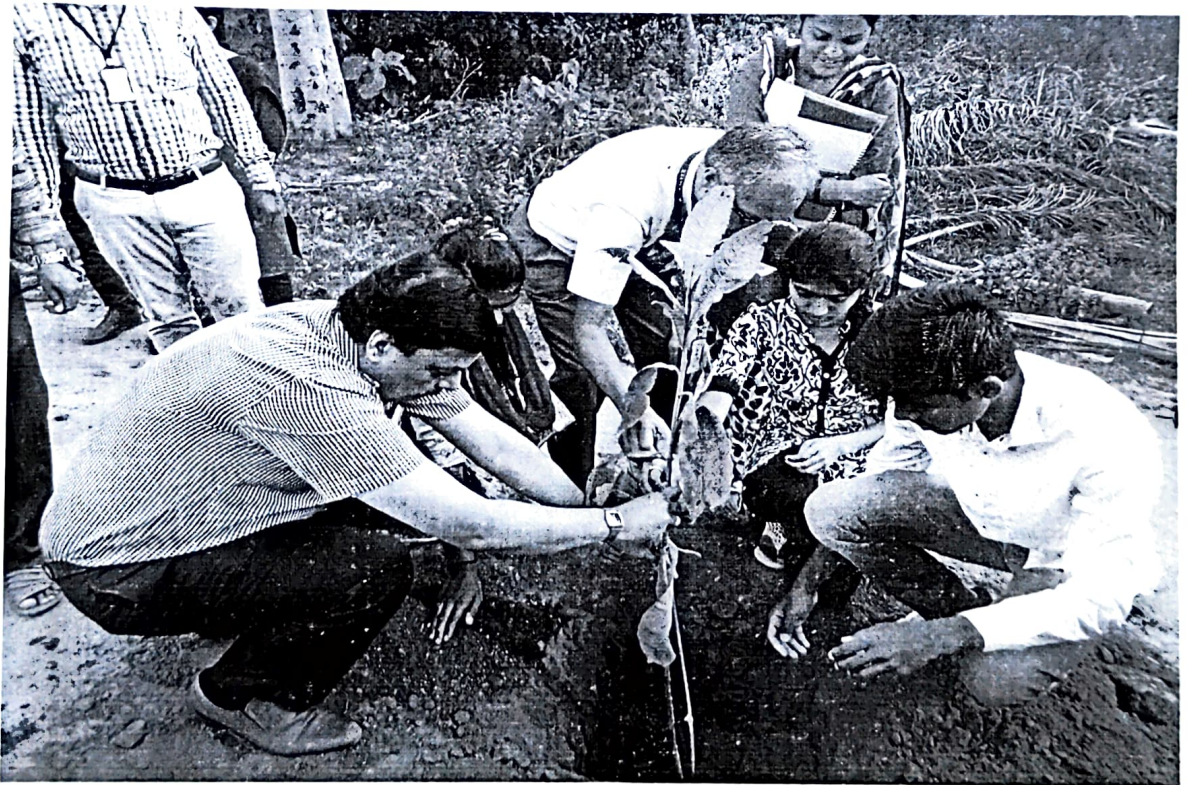
Fig: planting of Sapling - Department of CIVIL , 1 st year students with principal.