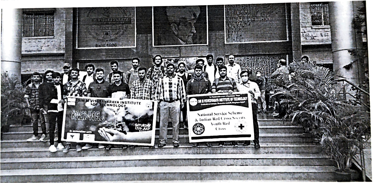
PIC : all Department HOD, staff, students group photos