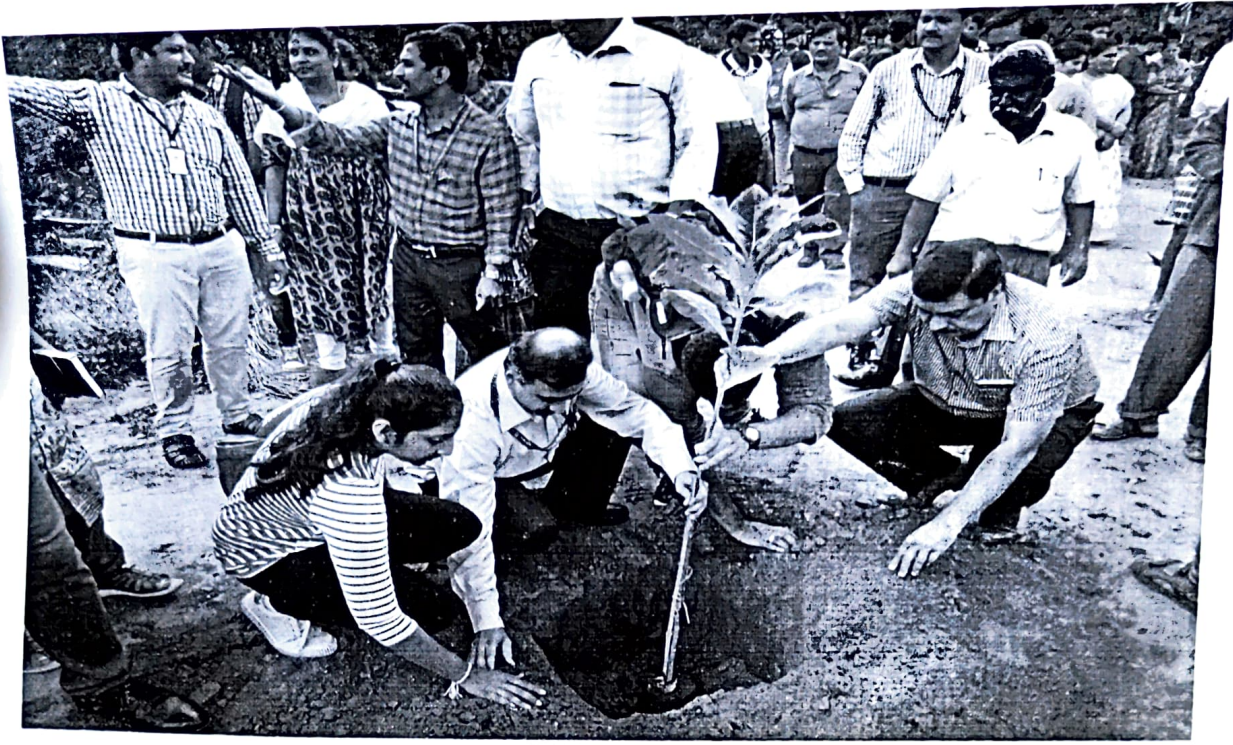
Fig: planting of Sapling - Department of Biotechnology , 1 st year students with principal.