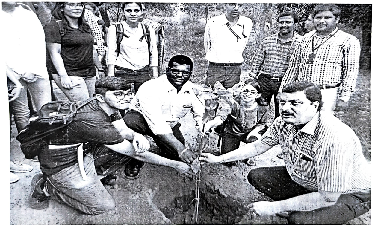
Fig: planting of Sapling - Department of ISE , 1 st year students with principal.