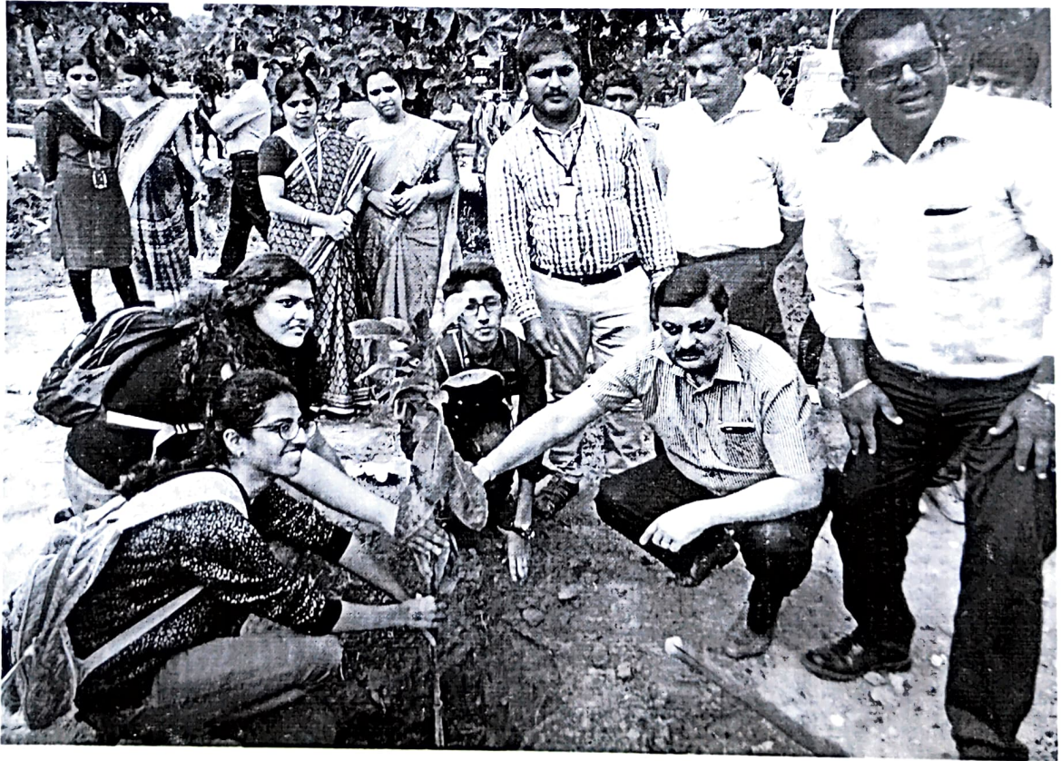
Fig: planting of Sapling - Department of CSE, 1 st year students with principal.