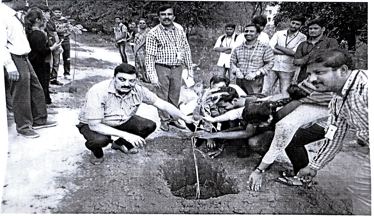
Fig: planting of Sapling - Department of Mechanical , 1 st year students with principal.