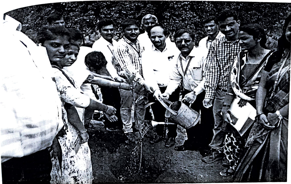
Fig: planting of Sapling – Local Gaurdians, Class teachers of all Departments