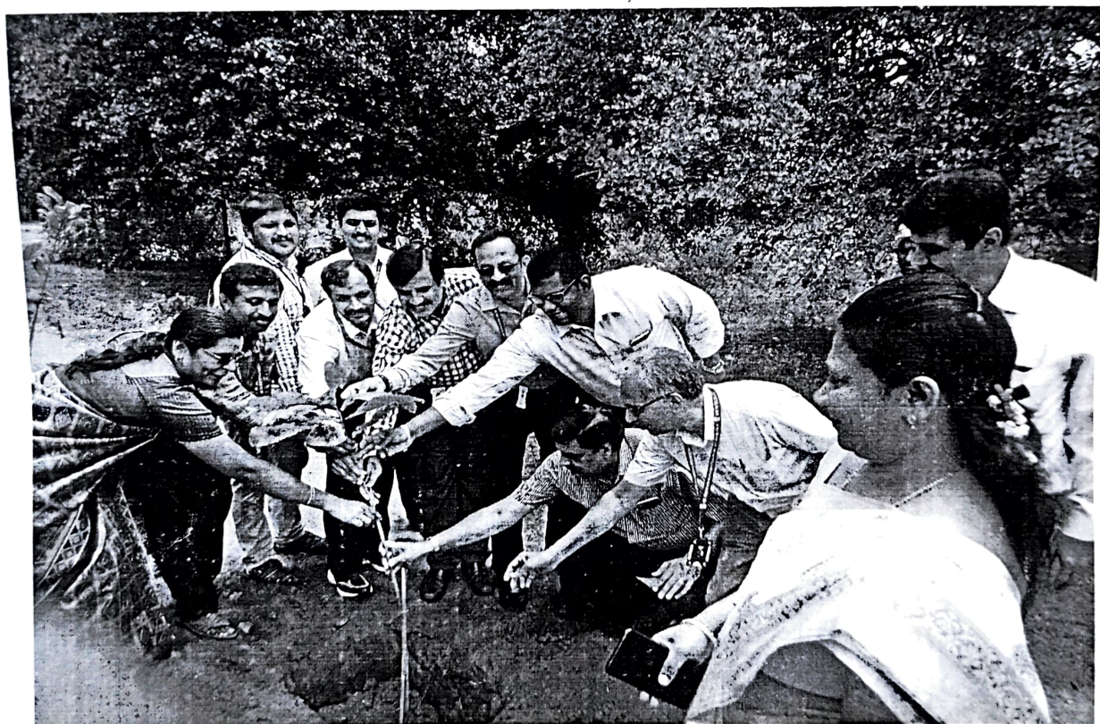
Fig: planting of Sapling – Heads of all Departments with principal.